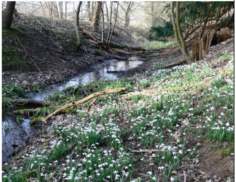
Snowdrops on walk around Northill Home Wood Medieval Fishery.