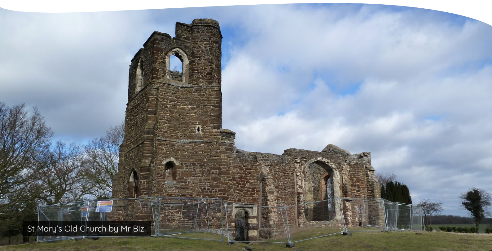
St Mary's Old Church

Take a tranquil stroll along the track to Old St Mary's and discover the array of wildlife in the old Churchyard. Its location on the Greensand Ridge means you will experience some amazing views of the surrounding countryside. The observation tower, which has recently been renovated, offers a spectacular panoramic view. The Clophill Heritage Trust offer tours of Old St Mary's for a small charge. The Trust also manages the Eco Lodges across the track from the Church, selling locally made and natural products. Although there is no vehicular access to the site, parking is available in Clophill Village.