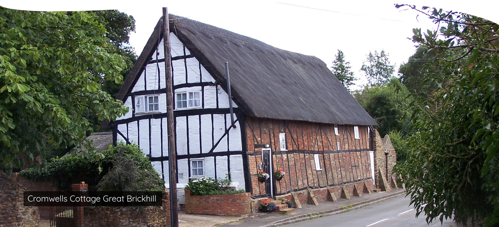
Cromwells Cottage Great Brickhill

The Great Brickhill Parish contains a large number of sandstone structures, which contribute strongly to the character of the area. The village of Great Brickhill has a long history, first documented in the Domesday Book as Brichelle. During the English Civil War it was home to the Parliamentarian, the Earl of Essex, and his army. Evidence of their stay is visible in the village today with 'Cromwell Cottages' on Ivy Road.