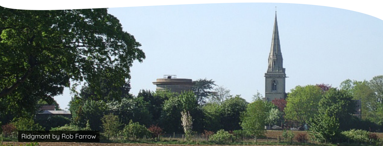
Ridgmont by Rob Farrow

The name Ridgmont is derived from the Norman French word 'Rouge-mont', meaning red hill. In fact the soil here is a very deep reddish brown colour. The underlying geology attracted an important industry to the village during the 20th century, with a brick works first appearing in Ridgmont in 1935. By the late 1970s the brickworks was said to be the second largest in the world. The railways have also had an impact on the industry in the village, with the Ridgmont Railway Station located next to the brickworks, now the site of an Amazon warehouse served by the station. The former Grade II listed station house, which was built in 1846, has been converted into a tourist destination, with a tearoom, gift shop and the booking office now a heritage centre. For those wishing to be more active, there are various linear and circular walks starting at the heritage centre.